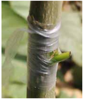
Figure 2.Grafted bud for making stem cutting

harvested and there were no clonal differences of root stock or scion on growth and yield of trees. The technique is also used to rejuvenate old trees by serial propagation to induct them first time in production system.