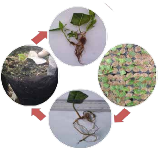
Figure 3. Propagation through leaf cuttings

In general, the vegetative propagation of poplars is easy. Vegetative means that have been used for the reproduction of poplars in India are coppicing, the use of stem cuttings (from single bud short cuttings to multiple bud standard cuttings 8-9 inches in length; tender, semi hard and hard wood cuttings), root cuttings, root + stem cuttings, bud sprouts, leaf cuttings, grafting, budding, stem cuttings with budded scions, layering, and tissue culture. Each is a significant way of propagating poplars in commercial production, improvement and other scientific works. Of the three methods summarized above, the first two are operationally applied for mass multiplication, depending on species and purpose for propagation. The third – the use of leaf cuttings – is still experimental. The percentage of plants produced in proportion to the planted cuttings is highest in root cuttings, followed by stem cuttings and leaf cuttings. P. deltoides is the main planted poplar, and its two dozen cultivars form the bulk of plantations (up to 99%). Many are mass multiplied to built up stock to meet sudden demand for selected cultivars from growers and for the rejuvenation of mature trees.