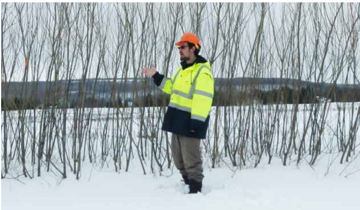
Fig.1: A shrub-willow living snow fence in New York State just four years after planting with height and branch density sufficient to create snow storage capacity thirteen times greater than the average annual quantity of blowing snow transport at the site.

The high branch density and rapid height growth of SWLSF provide the two vegetation characteristics most critical to snow trapping and storage. A recent study conducted by researchers at the State University of New York College of Environmental Science and Forestry (SUNY-ESF) has shown that the growth trends of SWLSF can create sufficient snow storage capacity for an average winter in most locations across New York State just three years after planting when best management practices are employed (Figure 1). A suite of critical best practices for SWLSF have been developed by SUNY-ESF to ensure this level of rapid functionality, long term survival, and maximum return on investment. These practices (which can also be applied to living snow fences of other vegetation types) include plant selection, site preparation, planting techniques, weed control, and integrated pest management.