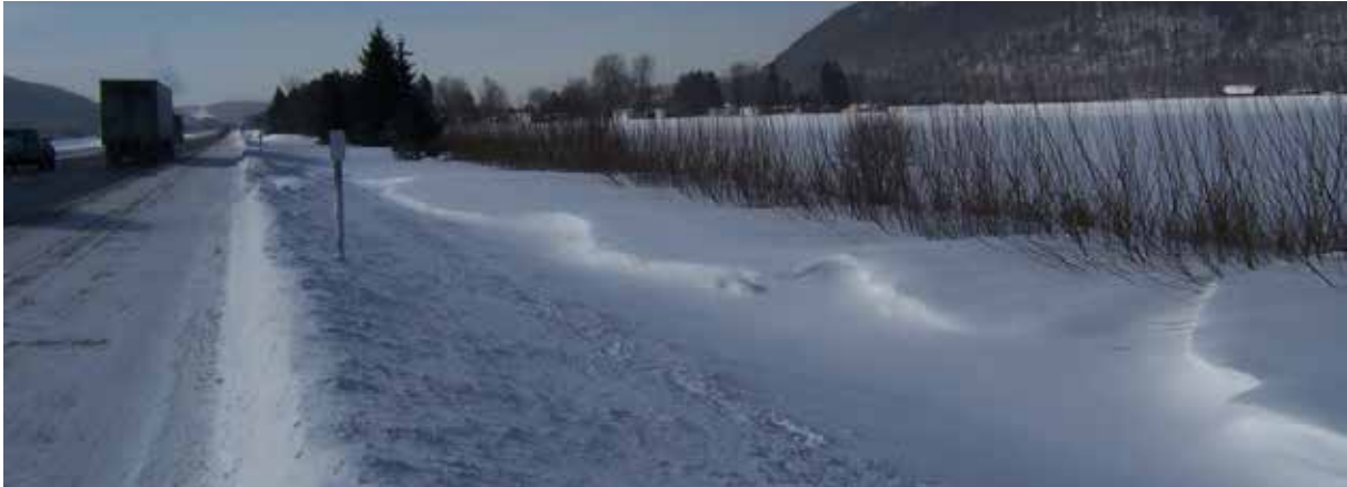
Fig.2: A SWLSF planted along an interstate highway in New York with at a setback distance of just 10 m and a seasonal downwind snowdrift fully contained within the setback distance between the fence and the road.

Recent research results from SUNY-ESF also indicate that properly managed SWLSF continue to add excess snow storage capacity in a linear trend for many years as plants continue to grow to larger heights. The impact of excess snow storage capacity relative to the quantity of blowing snow at a site is a reduced length of the downwind snow drift that is formed between the fence and the road. This reduced drift length allows SWLSF to be safely planted in relatively close proximity to roadways at setback distances as small as 10 m (Figure 2). This is much closer to the road than the 60 - 180 m setback recommendations found in current literature and educational publication of living snow fences. Reduced setback distance allows SWLSF to be installed closer to the roadway on sites where planting space is limited, a common occurrence in New York State and other regions. Installing SWLSF at appropriate setback distances also reduces the chance of blowing snow problems occurring between the fence and the road, and reduces unnecessary and costly land acquisitions or leases. Large amounts of storage capacity also provides a buffer against extreme weather events, winters with above average snowfall, and regions with higher annual quantities of blowing snow. The recent research on SWLSF by SUNY-ESF has also yielded new models of fence growth and snow trapping potential over time that can further improve the design, function, and economic performance of SWLSF.