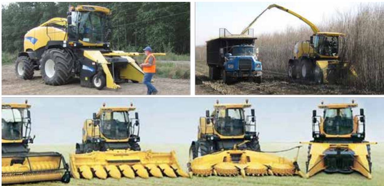
Fig. 1: Top left: A New Holland FR 9060 forage harvester with a 130 FB Coppice Header attached being prepared for a hybrid poplar harvest in Western Oregon. Top right: A FR-9080 forage harvester operating in a willow plantation at Auburn, NY in November 2012. Bottom: Examples of available headers for the New Holland FR 9000-series of forage harvesters including the 130 FB coppice header on the far right.

The New Holland harvesting system has resolved the inconsistent chip size issue with greater than 80% of the chips being between 25 and 45 mm in size and less than 3% being smaller than 6.4 mm in size. The consistent chip size produced by the harvester was demonstrated across 14 willow cultivars and under different weather conditions. The moisture content of 195 samples collected from harvesting trials in 2012/2013 was also very consistent (average and standard deviation of 44.4 + 2.2%) and only 0.5% of the samples had moisture content greater than 50%.