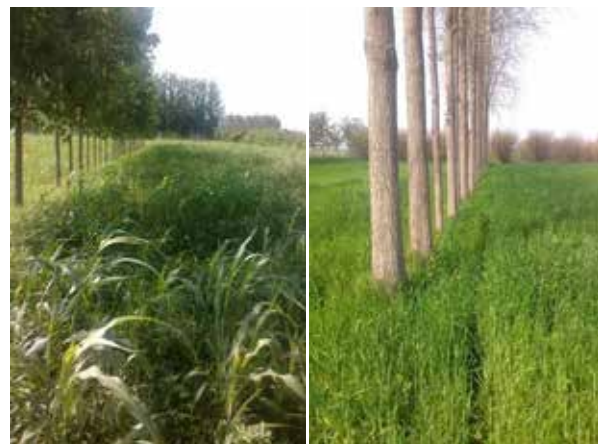
Poplar and sorghum

2 Thuenen-Institute for Forest Genetics, Sieker Landstr. 2, 22927 Grosshansdorf, Germany