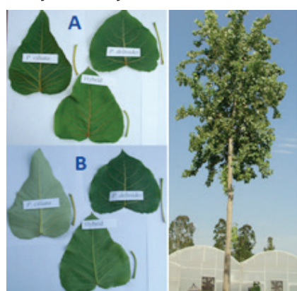
Fig-I. Left top (A): Ventral view of leaves of P. ciliata , P. deltooides and Hybrid; Left bottom (B): Dorsal view of leaves of P. ciliata , P. deltooides and Hybrid; Right: Five year old hybrid tree.